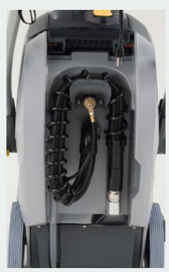
Integrated hand tool (standard on XP and XLP models)

Visit http://www.advance-us.com or contact your Advance sales representative to learn more.