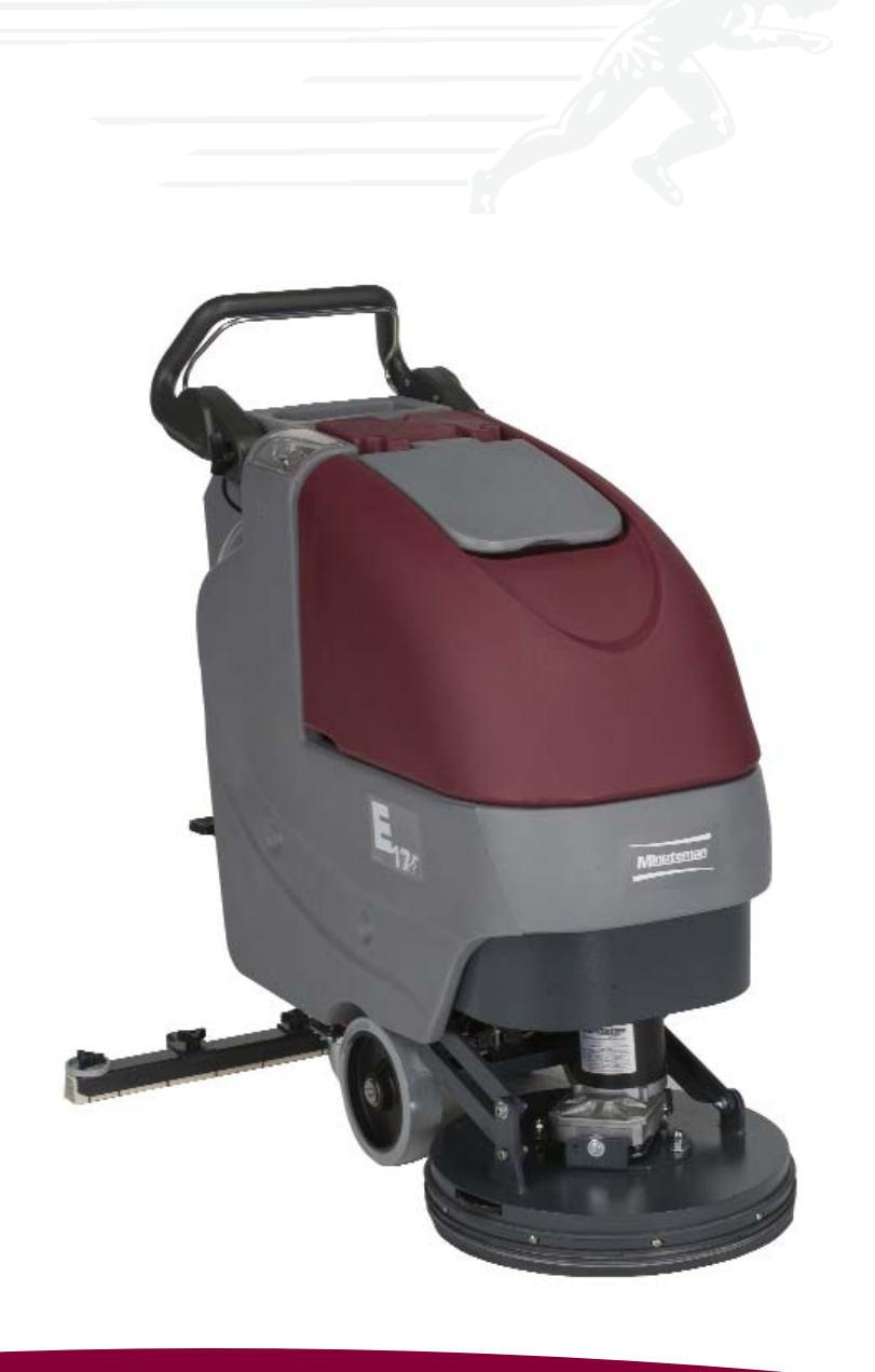
E17 17" Walk-Behind Scrubber