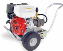
Direct Drive Cart and Skid