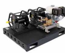
HD Pallet Skid with 2 Hose Reels 1 9.807-833.0 Mild steel 50 gal water tank and 1 - 100' hose reel 180 lbs 40" L x 48" W x 35" H