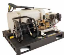
HD Pallet Skid with Tank 0 9.807-833.0 Mild steel 50 gal water tank and 1 - 100' hose reel 180 lbs 40" L x 48" W x 35" H