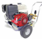
Belt Drive Cart and Skid