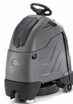
CHARIOT™ 2 IGLOSS 20